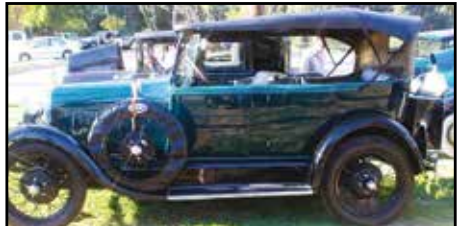
Club outing at Citrus Park, Riverside.

Orange Blossom A's: Our Club meets at 7:00 p.m. on the second Monday of each month at Fritts Ford Truck Center, second floor