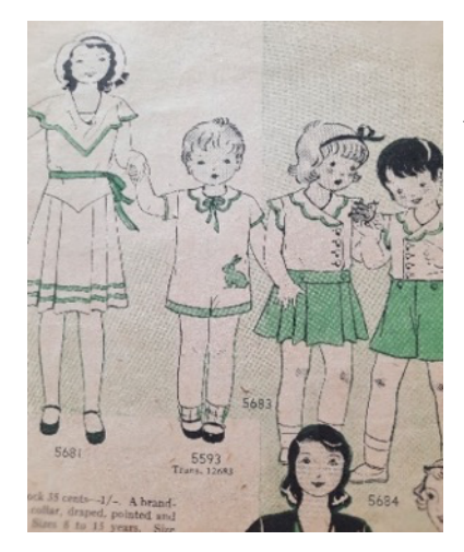
Applique' is the process of layering a fabric design on a foundation fabric with raw edges covered by thread of the same color to finish it. This technique lends itself to children's clothes, a young woman's afternoon dress, sporting attire, and some lingerie. The photo to the left shows a child's cotton suit has a cute rabbit for summer fun.