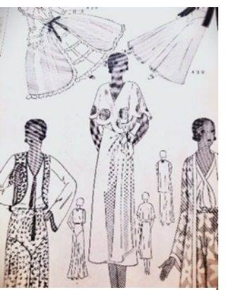
Delineator December 1930