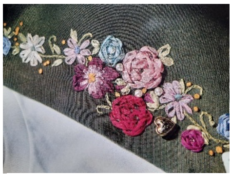
Example of Silk Ribbon Embroidery

Silk ribbon embroidery results in an elegant spray of flowers, animals or an artistic design using silk ribbon instead of thread. Greater space is covered in a shorter time with this technique. Women's undergarments as well as wedding attire would have this fancy style of stitching.