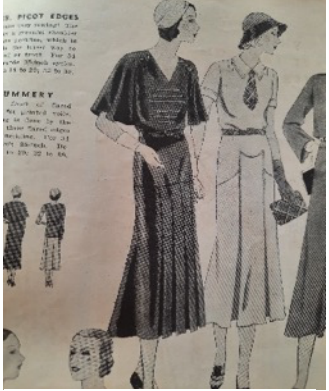
Delineator May 1931