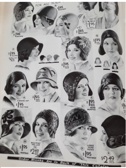
Sears Roebuck Catalogue 1930

Patchwork is the technique of joining pieces of fabric together with decorative embroidery stitches.