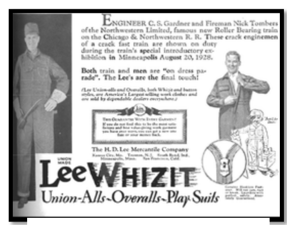
Frisco Employees Magazine 1929

Colonel Lewis Walker, Whitcomb launched the Universal Fastener Company to manufacture the new device. The clasp locker debuted at the 1893 Chicago World's Fair and was met with little commercial success. The Universal Fastener Company moved to Meadville, Pennsylvania, where it operated for most of the 20th century under the name Talon, Inc.