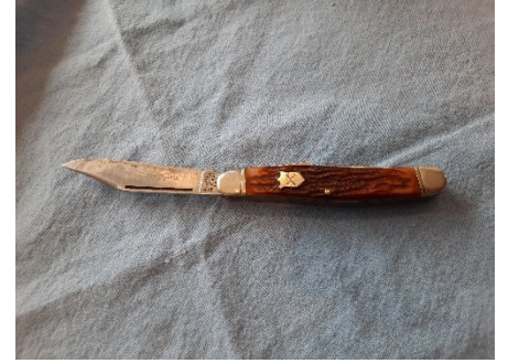
Figure 1 Camillus Knife

MAFCA fashion judges are always curious as to what is pulled from the pockets of the gents, and carefully removed from the fragile purses of the ladies. Pocket watches, handkerchiefs, compacts, pen and pencils, mirrors, or coins are commonly seen. How about pocket knives? While not the usual accessory, pocket knives can make an impact and will make a point of the