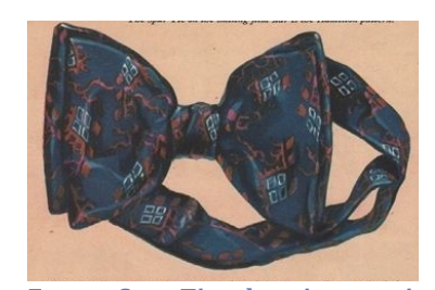
From a Spur Tie advertisement in The Saturday Evening Post 1928

For the Model A gentleman, one did not go out and about in public without a tie around his neck. A bow tie is a necessary accessory for formal wear, and can be a fun addition for casual fashions. However, tying the perfect bow takes practice to get it perfect. Some friends in the Model A hobby happened upon an expert who gave them the following step-by-step process in an effort to help their men "get it right." I thought I would share these steps for the rest of the men out there!