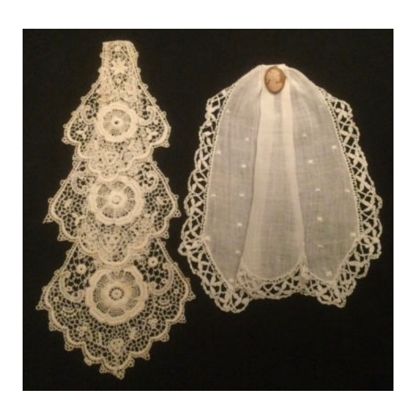
The jabot with the cameo pin is also hand made, but is more modern looking. Many jabots look like fancy handkerchiefs folded and pinned to the bodice front. Before you pin, remember that pins leave holes that often cannot be repaired.

In the photo at near right is a modern dress with a triangular bertha collar. The small amount of vertical gathers I put in the collar near the neckline created a slight jabotshaped drape that added a hint of "vintage." Pinning on the jabot, far right, really cranked up the vintage look.