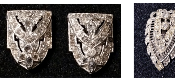
Several antiquing and eBay finds from my collection.

The widespread wearing of dress clips lasted into the late '50s, and as such, they are still an easy item to find in antique stores, or online sites such as eBay, and Etsy. Be aware that they are often misidentified as shoe clips, but dress clips usually have a much larger clip, with more aggressive spikes to secure them. Look for classic art deco designs, and you will have a nice accessory for your Model A wardrobe.