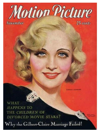
Carole Lombard on the cover of the "Motion Picture Magazine", November 1931.

The prevalence of dress clips was helped by their visibility on Hollywood stars. In the 1920s, going to the moving pictures was a favorite leisure activity in the United States. Seeing all those sparkling items on the screen or in the movie magazines and then being able to go to Sears and buy a similar one for 35 cents helped dress clips surge in popularity.