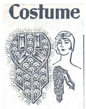
Wear two of these ex-quisite Clasp-Ons says fashionable Paris. One perched on the hat, the twin gracing the frock. White metal with sparkling imita-tion diamonds. Clasp them anywhere. Postpaid. 14K608A Price, 79c

Montgomery Ward & Co. Spring/Summer 1931 "Wear two of these exquisite clasp-ons says fashionable Paris."