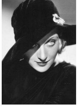
Carole Lombard wearing a dress clip as a hat ornament, 1931.

The widespread wearing of dress clips lasted into the late '50s, and as such, they are still an easy item to find in antique stores, or online sites such as eBay, and Etsy. Be aware that they are often misidentified as shoe clips, but dress clips usually have a much larger clip, with more aggressive spikes to secure them. Look for classic art deco designs, and you will have a nice accessory for your Model A wardrobe.