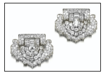
A pair of Cartier diamond clips, circa 1930