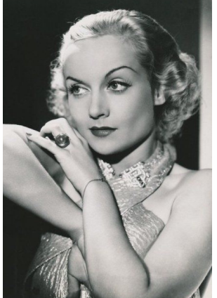
Another publicity shot of Carole Lombard from 1929. Note the dress clips on the wrap-around collar.