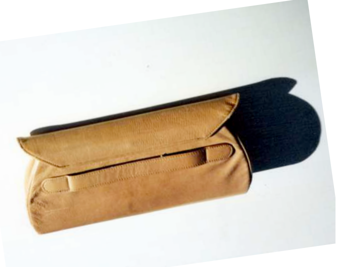
Horizontal back strap on leather purse Private collection Pegge Blinco

This is an example of the type of information that is needed when "updated fashion information" is submitted to the Era Fashion Committee for review and approval prior to being accepted for the MAFCA web site and future updates to the Fashion Guidelines .