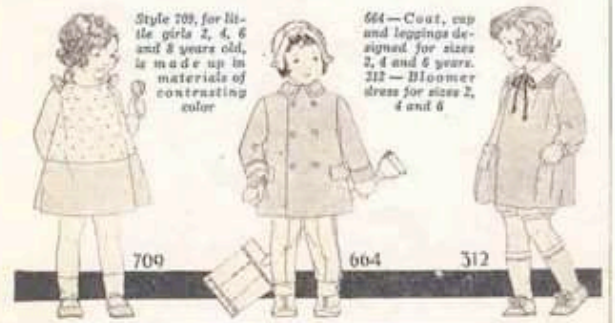
Patterns, 15c each, postpaid, may be secured from Woman's World, 4223 W. Lake St., Chicago

The ensemble idea is so strong that bonnets or hats are often made of the same material as the coat. A little close hat will be as warm as a bonnet and in addition will have much more class.