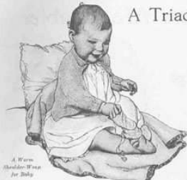
A Warm Shoulder-Wrap for Baby

With No. 3 needles knit the cuff to correspond with the first.